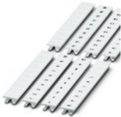
Zack marker strip, 10-section, horizontally labeled with the consecutive numbers: 61 ... 70, white, width: 5 mm

Please be informed that the data shown in this PDF Document is generated from our Online Catalog. Please find the complete data in the user's documentation. Our General Terms of Use for Downloads are valid ( http://phoenixcontact.com/download )